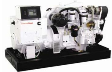
Standard model without sound shield