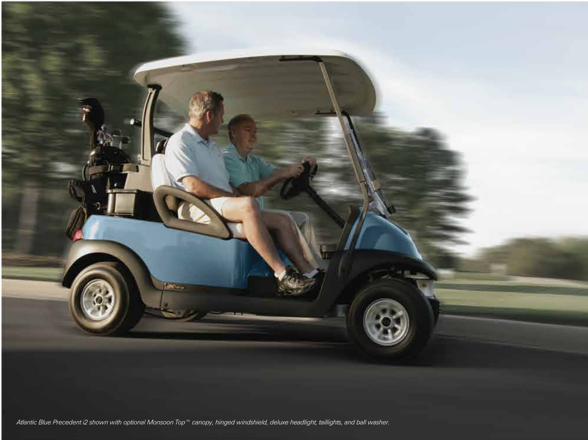
Atlantic Blue Precedent i2 shown with optional Monsoon Top™ canopy, hinged windshield, deluxe headlight, taillights, and ball washer.