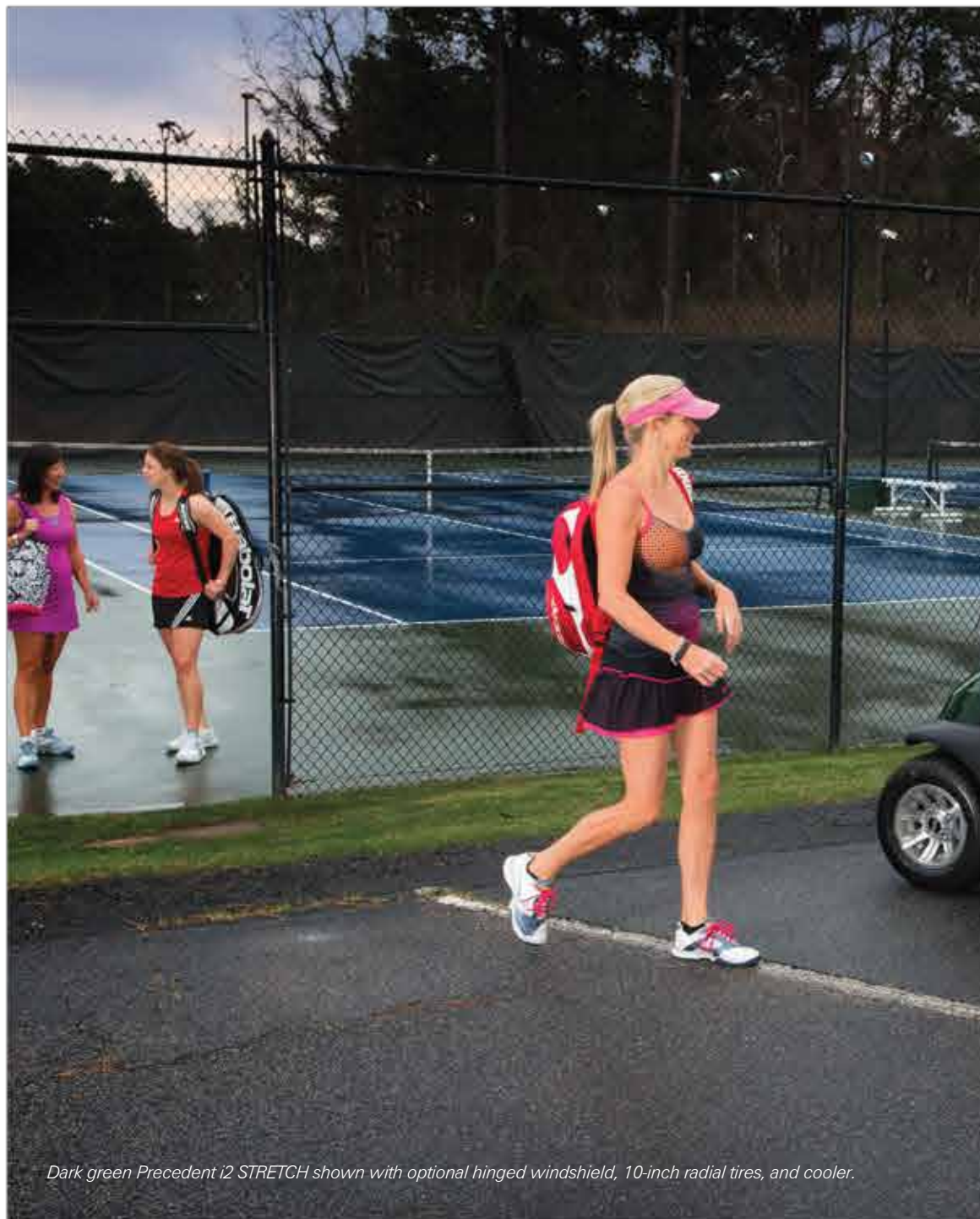
Dark green Precedent i2 STRETCH shown with optional hinged windshield, 10-inch radial tires, and cooler.