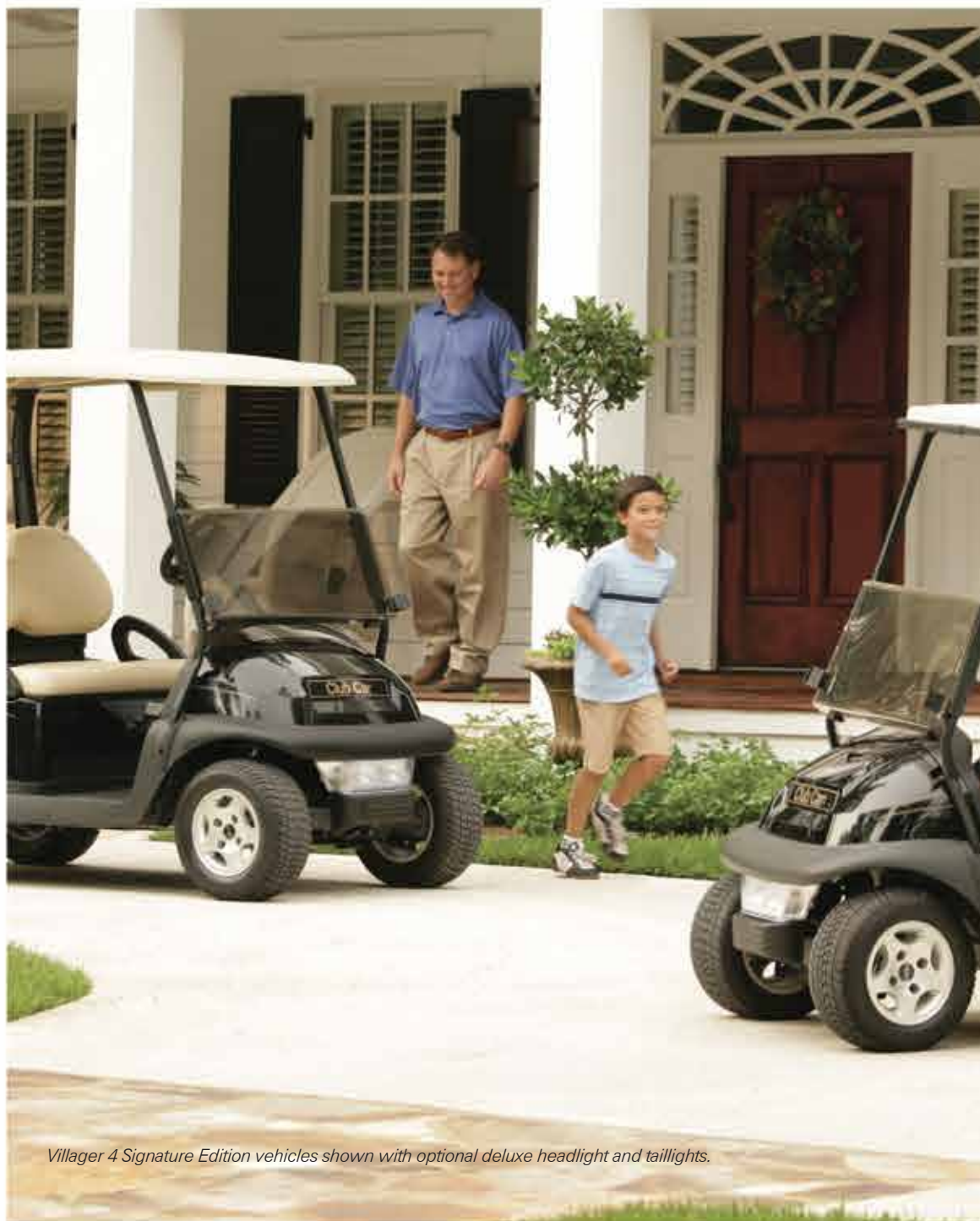
Villager 4 Signature Edition vehicles shown with optional deluxe headlight and taillights.

Above: Beige Villager 4 with optional hinged windshield, deluxe headlight, and 5-panel mirror.