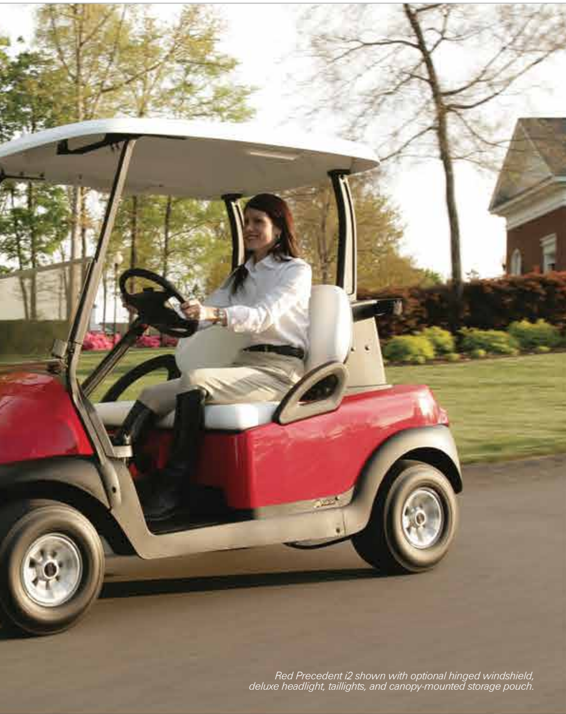
Red Precedent i2 shown with optional hinged windshield, deluxe headlight, taillights, and canopy-mounted storage pouch.